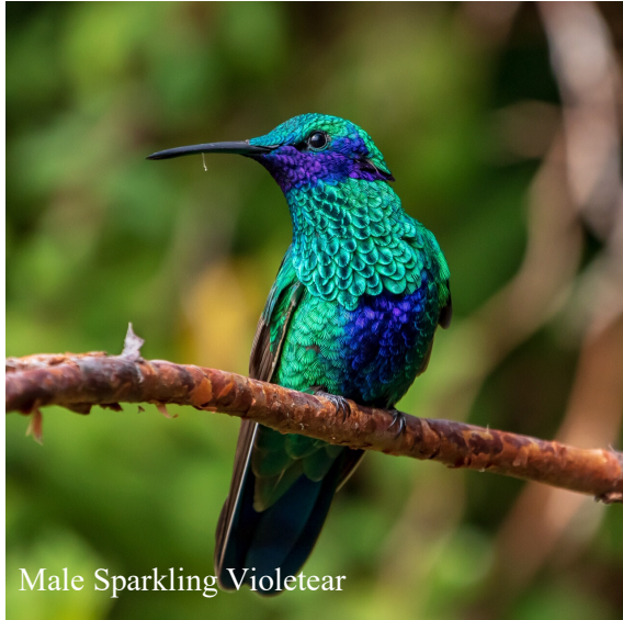
Male Sparkling Violetear

Comfortable shoes or hiking boots, hat, sunscreen, insect repellent, a good road map, Full fuel tank, drinking water, snacks and lunch, binoculars and/or a scope, field guide. Come and Enjoy. Cal Field Trip Leader for last minute cancellations, questions or changes... 🐦