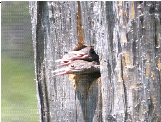
Three flickers wait for a meal.