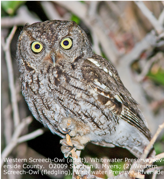
Western Screech-Owl (adult), Whitewater Preserve, Riverside County. (2) Western Screech-Owl (fledgling), Whitewater Preserve, Riverside

The Western Screech-Owl ( Megascops kennicottii ) is widespread throughout much of western North America, occurring from southeastern Alaska south and east to eastern Colorado and New Mexico, and central Texas. Its distribution continues into Mexico to at least as far south as Puebla, Michoacan, and Jalisco. This species is nonmigratory throughout its range.