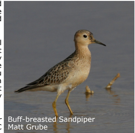
Buff-breasted Sandpiper Matt Grube

to 2016, the pipit provides the 4 th county record following two together at Big Bear Lake this May. The latter location had a SANDERLING (Aug 28), two PALM WARBLERS (Sep 28-Oct 6), and RED PHALAROPE (Sep 28-Oct 1). The best bird from the eastern Mojave Desert so far this fall was a one-day wonder CANADA WARBLER at Hole-in-the-Wall (Oct 5). Other notable birds from the region included single PAINTED BUNTINGS from Afton Canyon (Aug 30-31) and Primm Valley Golf Club (Sep 13), and BALTIMORE ORIOLE (Aug 31) and DICKCISSEL (Sep 19) at Zzyzx. Covington Park had a very cooperative adult male BALTIMORE ORIOLE (Sep 19-20) and a BROAD-WINGED HAWK (Sep 19). In the southwestern corner of the county, Prado Regional Park produced a presumably continuing BLACK SKIMMER, an AMERICAN BITTERN, and a SABINE'S GULL (all Oct 8).