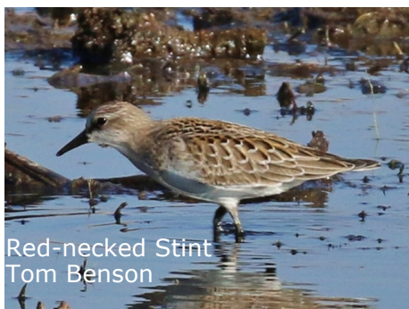
Red-necked Stint Tom Benson

While not a first county record (it was in fact the 9 th record), a MAGNIFICENT FRIGATEBIRD at Big Bear Lake (Aug 27) challenges the Buff-breasted Sandpiper for the title of best bird in the county during the period. Many of the good birds this fall have been at Harper Dry Lake or Kramer Junction solar evaporation ponds. The former hosted a SANDERLING (Aug 29-30), RED-THROATED PIPIT (Oct 12), PALM WARBLER (Oct 15), SHORT-EARED OWL (Oct 8-17), LAPLAND LONGSPUR (Oct 10-17), and SURF SCOTER (Oct 17); with only one record prior