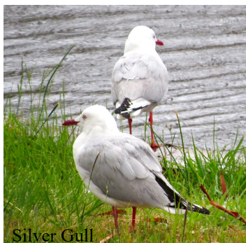
Silver Gull Dori Myers