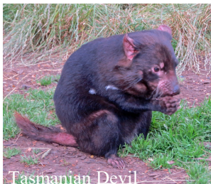
Tasmanian Devil Dori Myers

Tasmania is a fascinating island located off of Melbourne, Australia with a dozen endemic bird species. All 12 endemic species are seeable on a single trip with a little luck and some planning. And there's lots of other wildlife to be seen as well: wombat, wallaby, quoll, pademelon, and Tasmanian Devil, just to name a few of the interesting marsupials. The