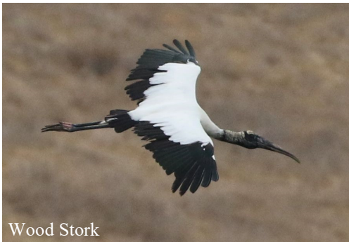
Wood Stork

Riverside County fared equally well this spring and summer. The best bird was a first county (and second state) record GRAY HAWK at Palo Verde Ecological Reserve (PVER) from Apr 12 through at least Jun 24. Vying for second best bird of the season were a WOOD STORK at Lake Elsinore Jul 17-19, a HEPATIC TANAGER at Lake Riverside Jun 3, and single CHIMNEYS SWIFTS at Prado Basin May 22 and Desert Center Jun 1. Other notable spring migrants included single AMERICAN GOLDEN-PLOVERS at the north end of the Salton Sea Apr 8 and 25, up to three BROAD-WINGED HAWKS at PVER Apr 15-17, a SANDHILL CRANE at San Jacinto Wildlife Area (SJWA) Apr 15, an EVENING GROSBEAK at Lake Hemet Apr 13, a BLACK TURNSTONE at Salt Creek Apr 21-29, an OVENBIRD at Joshua Tree NP Apr 29, a LEAST TERN at SJWA May 26-27, an EASTERN KINGBIRD at Desert Center Jun 1, and a TENNESSEE WARBLER at Desert Hot Springs Jun 15. Summer brought a few rarities to the Whitewater River delta, including a juvenile BLUE-FOOTED BOOBY Jul 10-Aug 9 and a WHITE-WINGED SCOTER Aug 9-11.