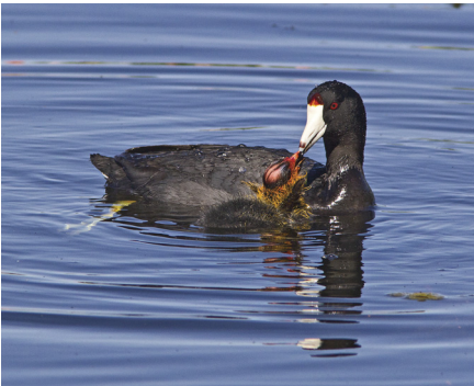
American Coot feeding Young