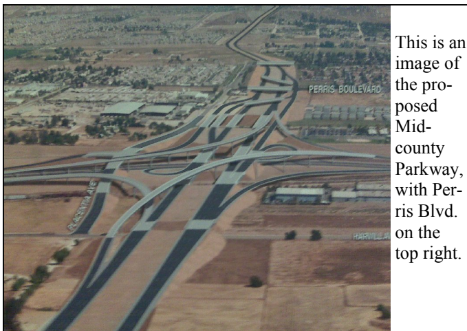
This is an image of the proposed Mid-county Parkway, with Perris Blvd. on the top right.

As a 501(c)3 corporation, donations to SBVAS should be tax-deductible, but check with your tax attorney or accountant before making such a claim.