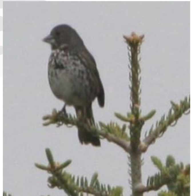
A Stephen's Fox Sparrow politely posed and sang for Gene's field trip group in the San Gabriel Mountains on June 6.

must use them, look for products labeled "pet safe." Be especially careful with snail and slug bait. It often contains metaldehyde, which is appealing and tasty to most mammals but also highly toxic. For less harmful ways to control pests, go to www.beyondpesticides.org/alternatives .