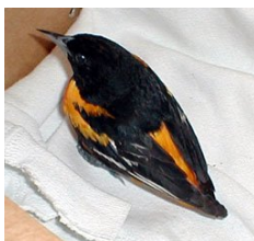
These are some pictures of Suzie and her patients.